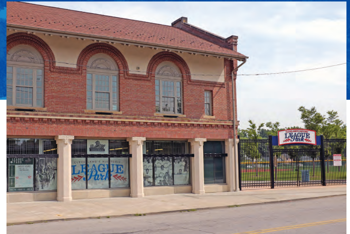
Historic League Park in the heart of the Hough neighborhood.