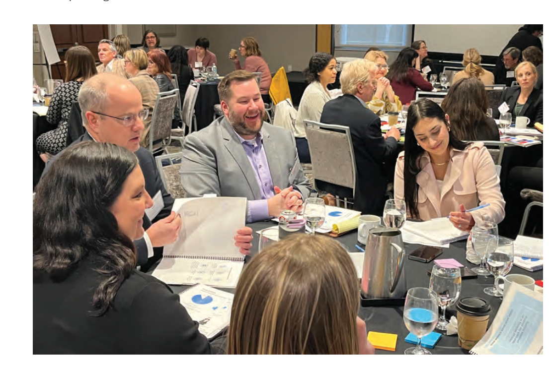
Above: Attendees worked together to brainstorm solutions to pro bono challenges at the Summit.