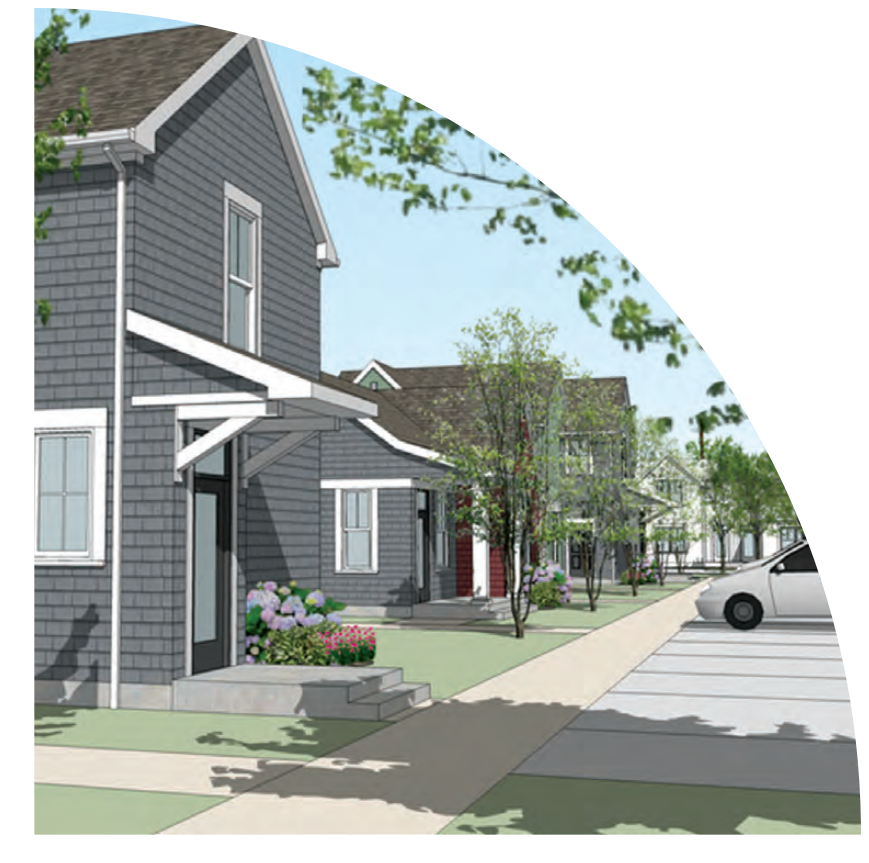
A RENDERING OF THE PROPOSED SENIOR HOUSING COMMUNITY IN GREENE COUNTY.

THE OHIO JUSTICE BUS HELD 70% OF ITS CLINICS IN RURAL COUNTIES.