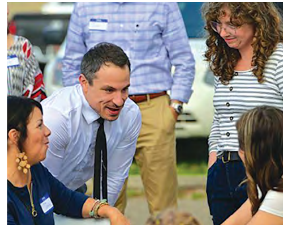
Legal aid attorneys and community members gather at the groundbreaking of a new homeless shelter in Tuscarawas County.

Ohio Legal Help served 270,000 rural Ohioans.